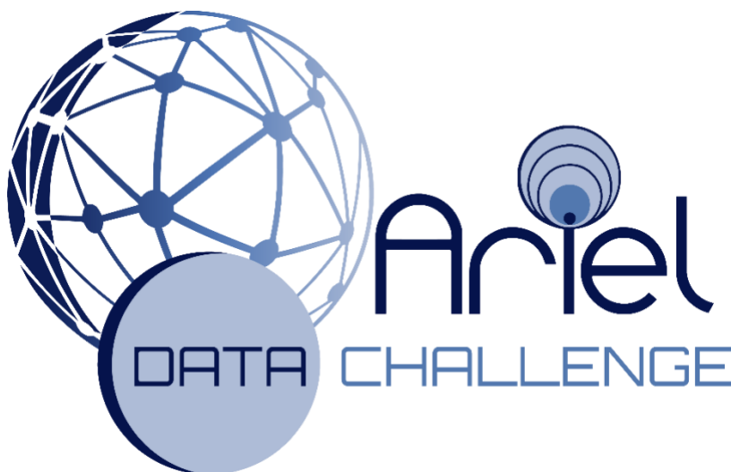
Ariel Data Challenge logo.

https://arielspacemission.files.wordpress.com/2020/11/ariel-telescope.jpg https://www.esa.int/ESA_Multimedia/Images/2018/03/Hot_exoplanet